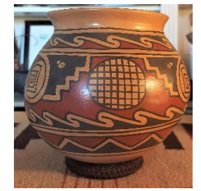
Mata Ortiz Olla by Daniel Gonzales Valued at $98 Pot 6" tall and 21" aroud, includes wrapped stand