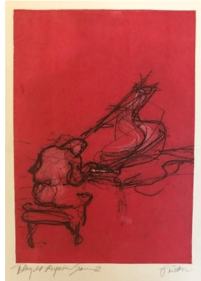
One of Joan’s popular live music pieces Matted it is an 11x14” Solar plate etching