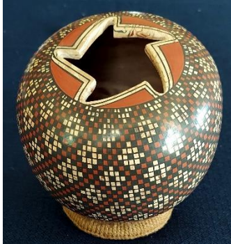
Mixed clay olla with carved star opening 5 inches high or 5 ½ on stand (included)